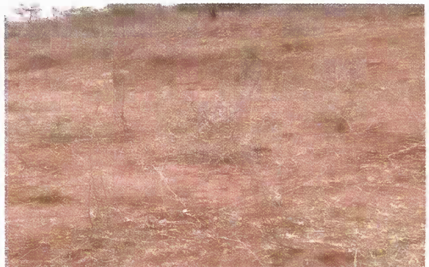
Plate 4: Low survival of trees due to poor soils and low soil moisture

Prepare the land before the rains (during the dry season) to enable early planting. Land preparation, which mainly involves land clearing and pitting, improves tree survival in the drylands when properly done.