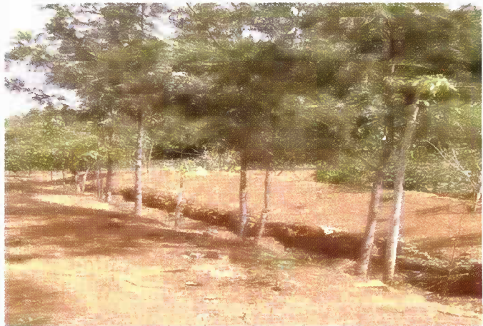
Plate 5: Trees planted along water retention ditches

Water harvesting and conservation structures are very important contributors to tree survival but are often ignored. Techniques that have proved very useful for dryland tree planting include water retention ditches such as cut-off drains, micro-catchments, and bottle watering.