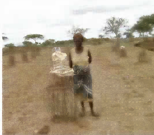
Plate 7: Individual tree protection

If you have many trees it may be cost effective to fence the entire plot. You can use chain link or barbed wire. Chain link fencing is expensive but very effective for control of all types of animals while barbed wire fence is moderately expensive but may not be able to control small animals such as young goats and dik diks. A barbed wire fence when reinforced with thorny branches can be quite effective for both large and small animals. You can further reduce the cost of fencing by relocating the fence to a second location after the trees are big enough.