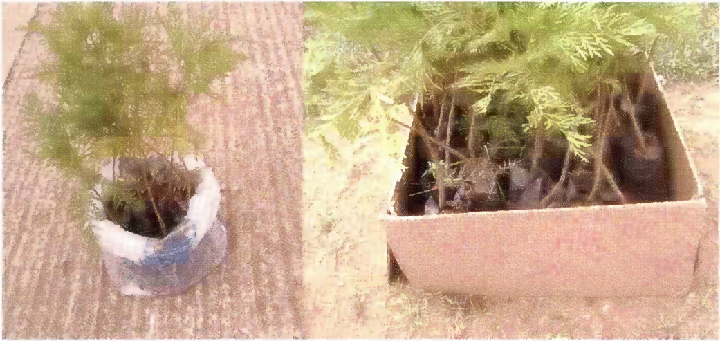
Plate 3: Well packed seedlings ready for transportation