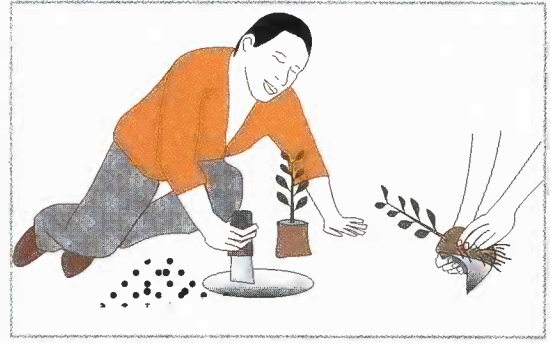
Figure 3: Planting a tree seedling

The best time to plant tree seedlings is immediately the rainy season begins. The earlier the planting the better the tree survival, as this exposes the planted trees to the maximum rainy days possible before the dry season starts. There should be enough moisture on the ground before you plant. Make a hole the size of the seedling container in the middle of the planting pit using a jembe or a machete (Figure 3).