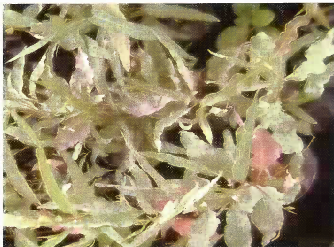
Plate 1: Diseased seedlings of Eucalyptus camaldulensis

You can also spray insecticides/fungicides on the seedlings before planting.