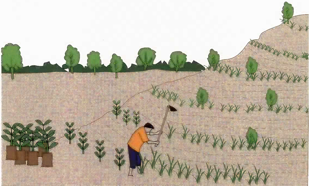
Figure 2: Intercropping of trees and crops