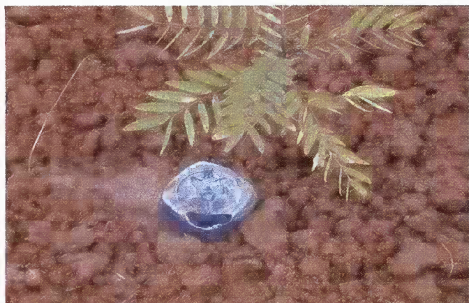
Plate 6: Bottle watering of Senna siamea

The stones direct the flow of water to the lower soil levels to be conserved and used gradually by the growing tree.