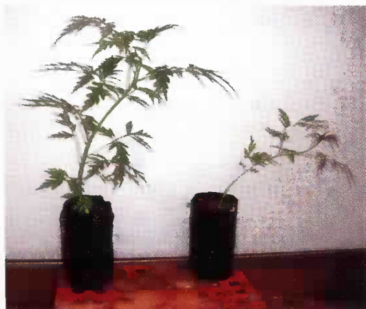
Plate 2: Hardened seedling of M. volkensii (left) has greyish stout stems. Unhardened seedling (right) is green and weak.

Hardening up is needed to prepare the seedlings to withstand the shock caused by possible harsh field conditions. Seedlings are hardened up in several ways such as through gradual removal of shade, increased frequency of root pruning, and reduced watering. If seedlings are from an external source, ensure that they have been hardened up. Characteristics of properly hardened up seedlings are stout stems and fewer but stronger leaves (Plate 2).