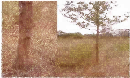
Plate 8: Grevillea robusta infested with termites