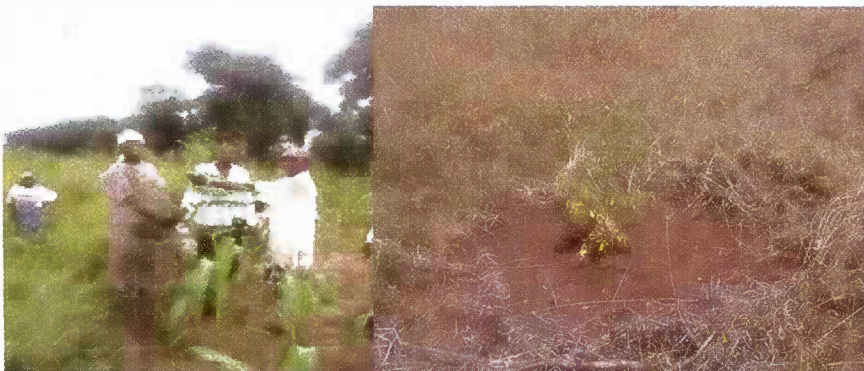
Plate 9: Completely weeded Melia volkensii trees (left) and spot weeded Melia of the same age (right)